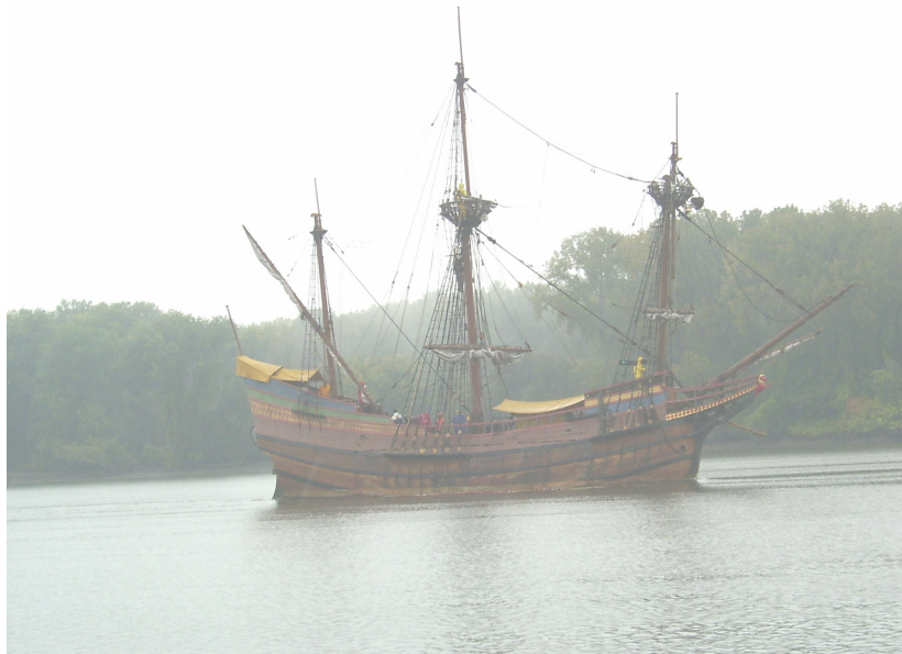
Sights on the Hudson River, New York State